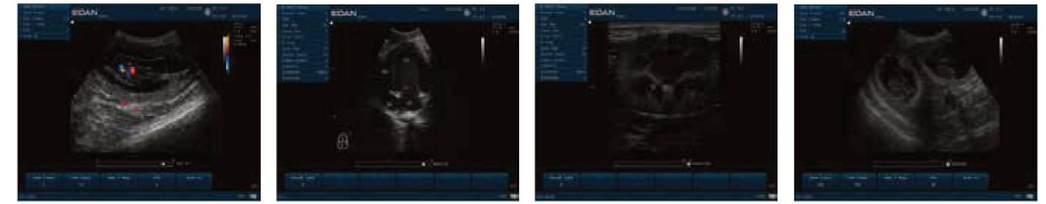
Feline GS CFM